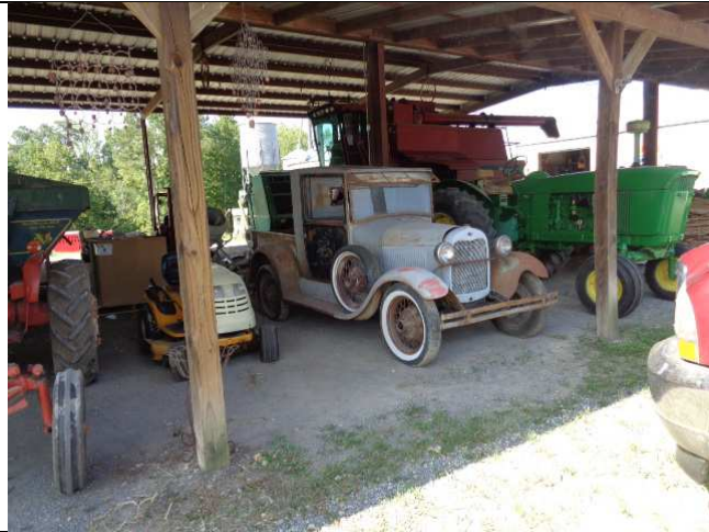
Finding treasures along the way.