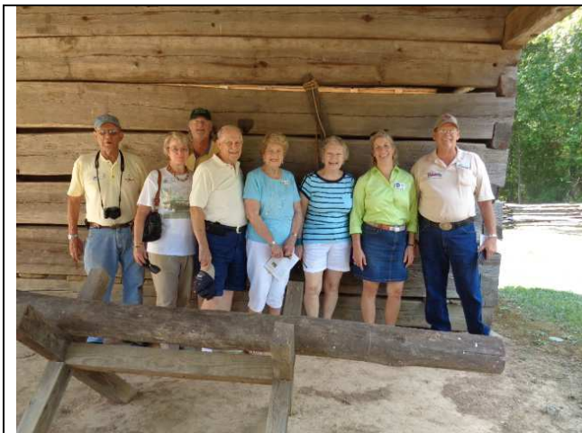
Members touring the New Echota Village.