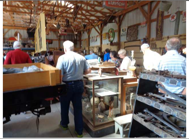
More digging for those great finds.