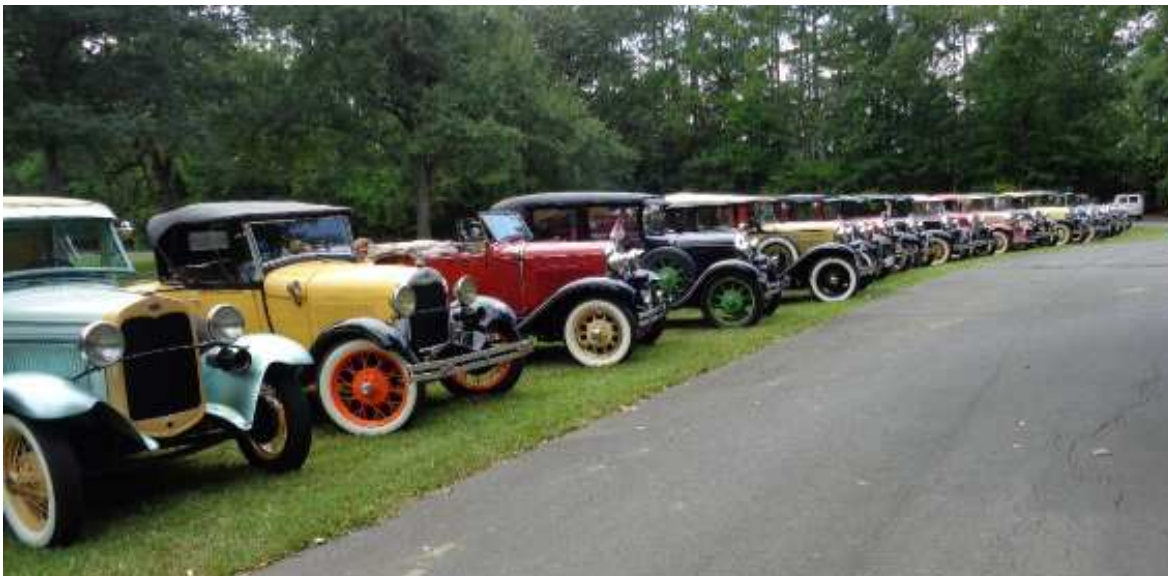
Lined Up at the Berry College Campus

The Forth, but not necessarily annual, Fun with Dick and Jane Tour got off to a good start on Friday with attendees arriving safely at the Hawthorne Hotel for check in. The Hawthorne Hotel is a restored 1890's warehouse with original wooden floors and brick walls, located in the historic district of Rome, Georgia. What a great turn out; 56 members and guests; 27 Model "A" Fords with attendees coming from Alabama, Florida, Georgia, and Tennessee!