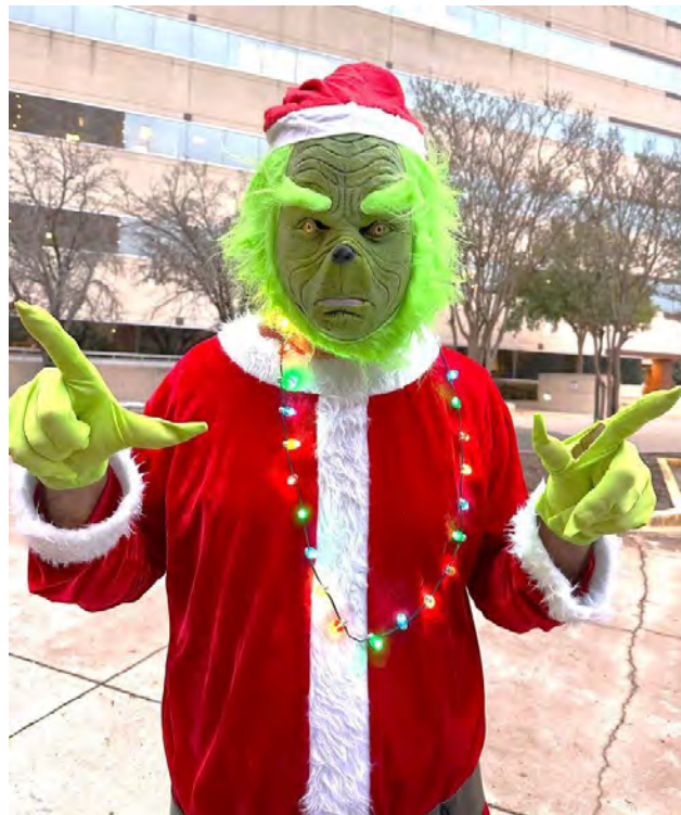
Our President, the Grinch