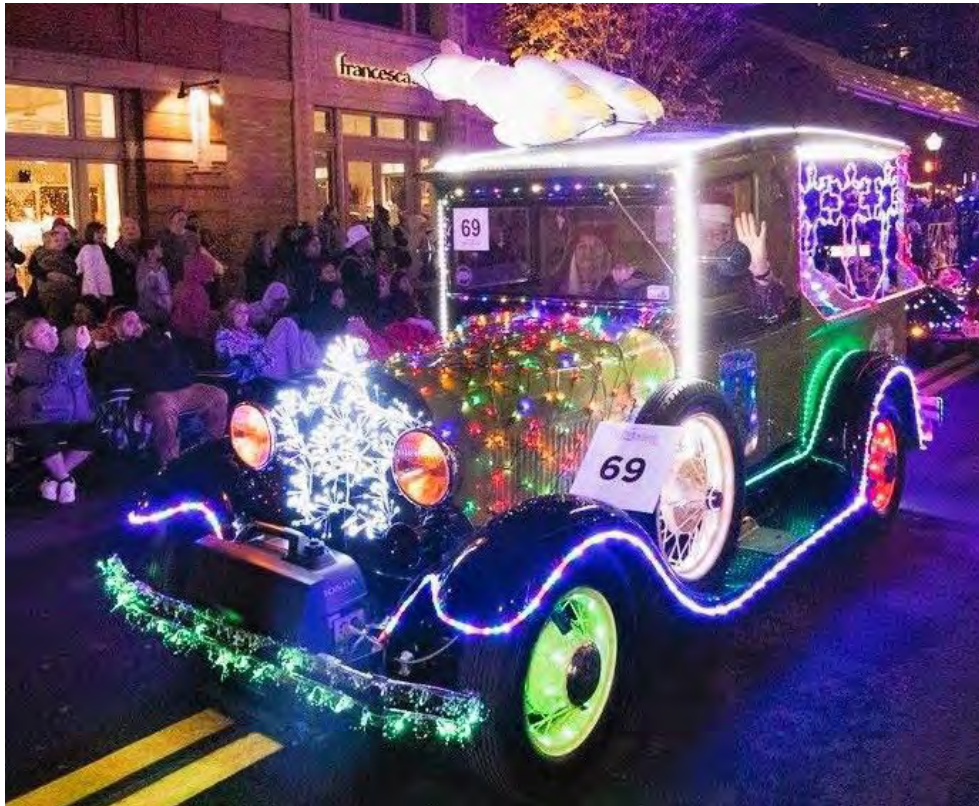
The Nixon's (The Unicorn fell over)