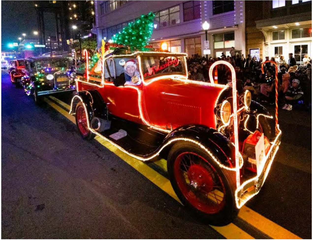
The Larson's Tree Hauler