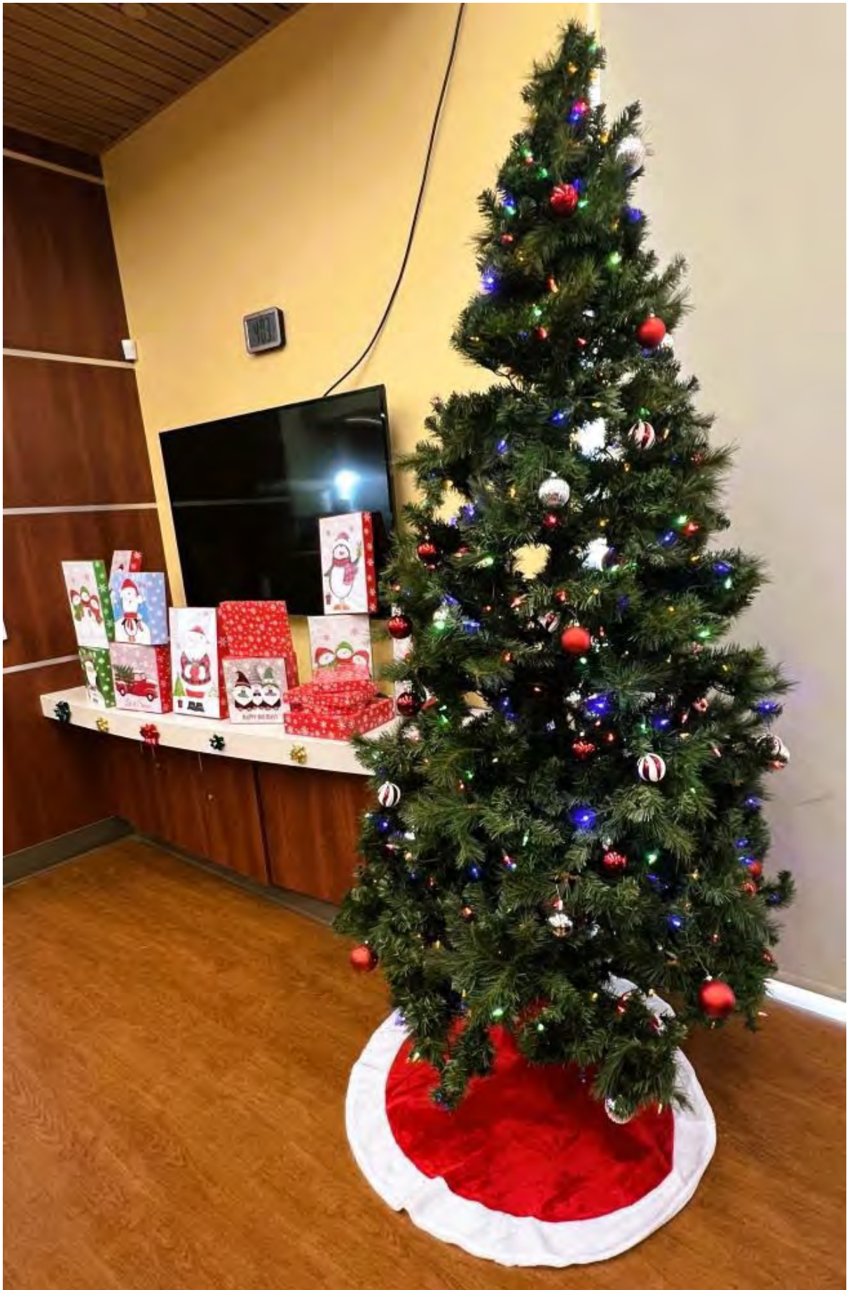
Christmas tree and presents.