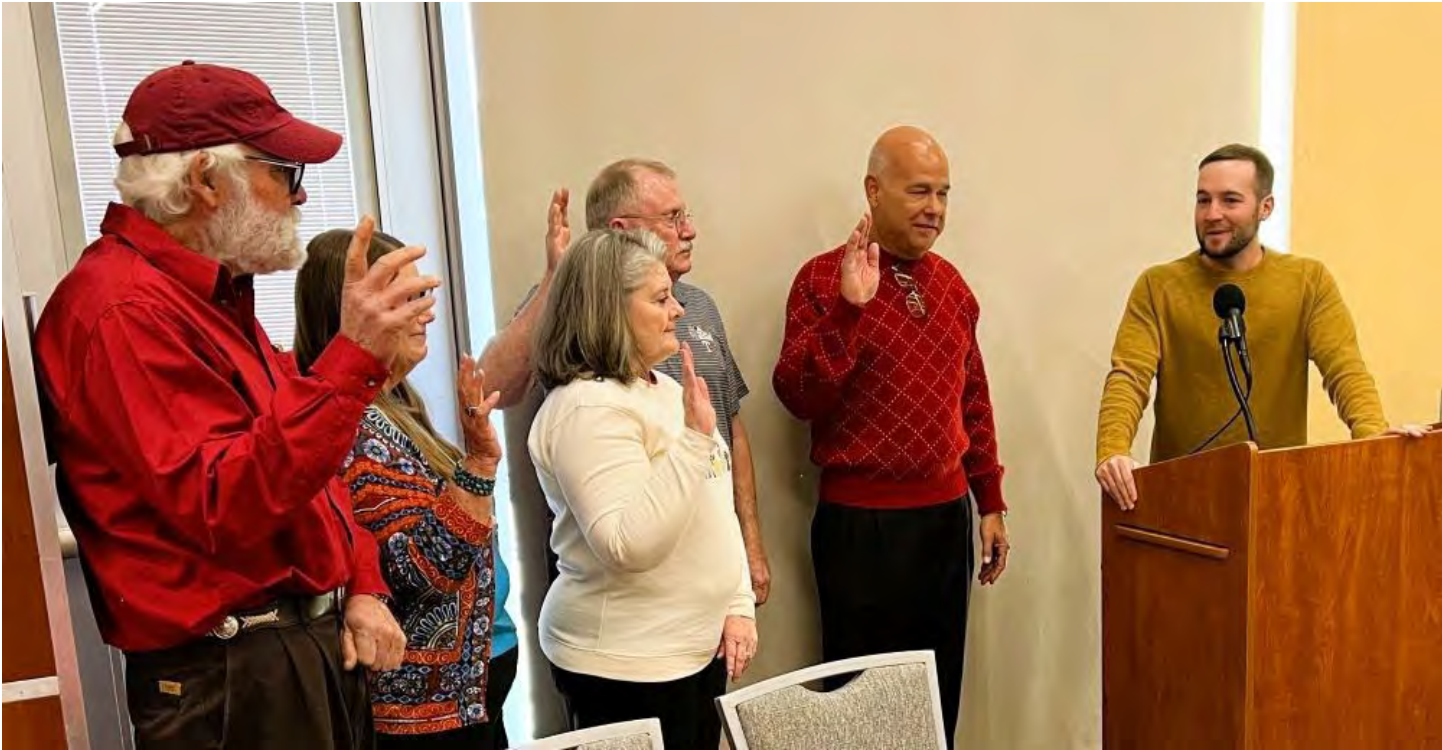
Officers are sworn in.