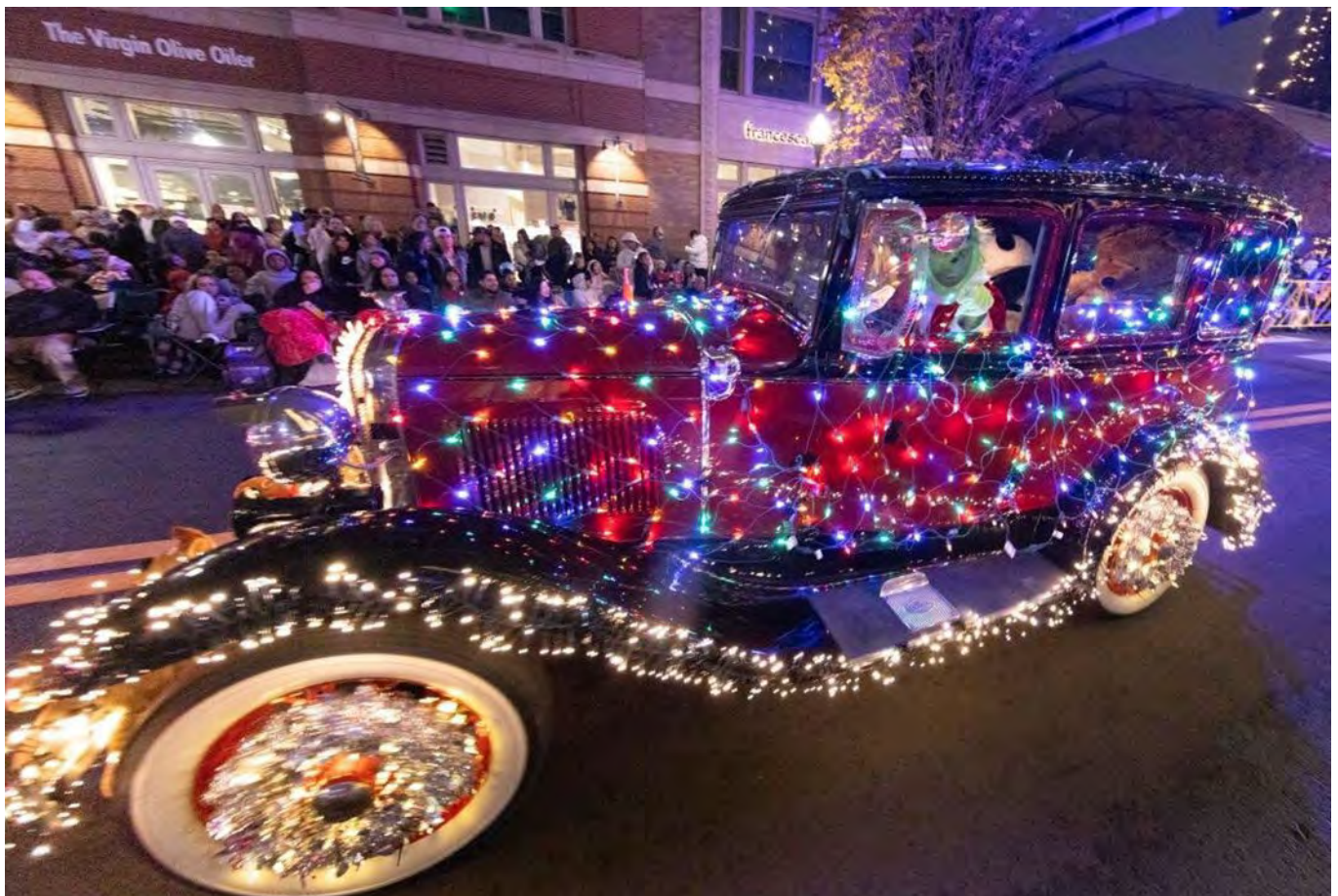
The Grinch and Vickie Stamp