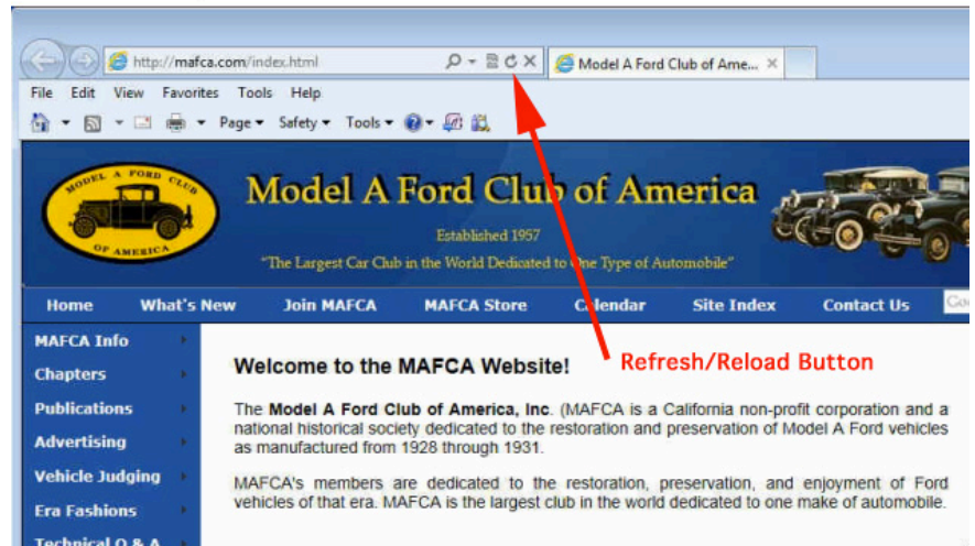
PC - Internet Explorer 9

If that doesn't work, then the next thing I do is to click on TOOLS menu ( on the top line – not the second line) and then "Delete Browsing History." Notice you can use the keyboard shortcut Ctrl+Shift+Del