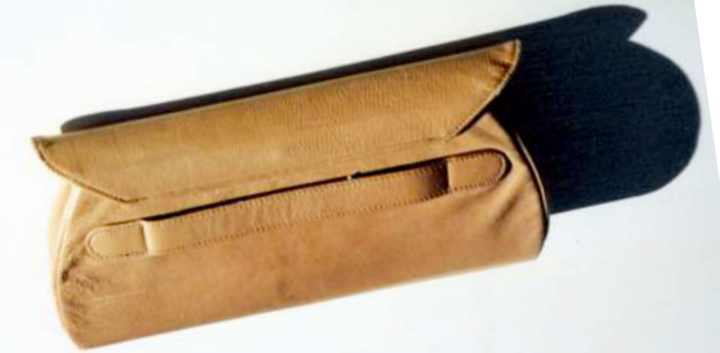
Horizontal back strap on leather purse Private collection Pegge Blinco

This is an example of the type of information that is needed when “updated fashion information” is submitted to the Era Fashion Committee for review and approval prior to being accepted for the MAFCA web site and future updates to the Fashion Guidelines .