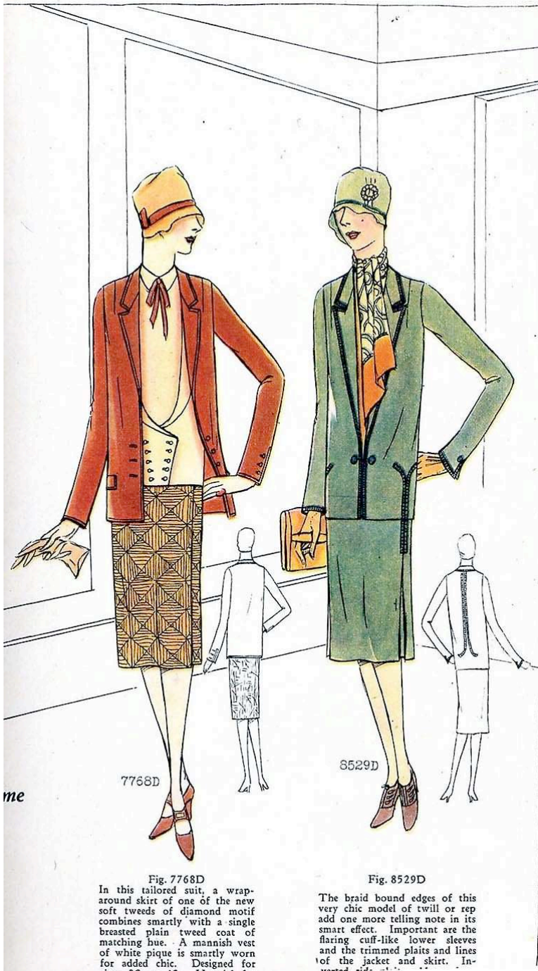
Fig. 7768D In this tailored suit, a wrap-around skirt of one of the new soft tweeds of diamond motif combines smartly with a single breasted plain tweed coat of matching hue. A mannish vest of white pique is smartly worn for added chic. Designed for