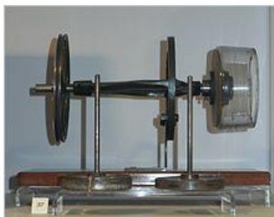
A device for spinning Viscose Rayon dating from 1901

Rayon is a versatile fiber that has the same comfort properties as other natural fibers. It is made from purified cellulose, which is the primary component of the cell walls in green plants. In the case of rayon, wood is usually the main ingredient. The cellulose is chemically converted into a soluble compound and then this solution is dissolved and forced through a “spinneret to produce filaments which are chemically solidified, resulting in synthetic fibers of nearly pure cellulose.” ii The fibers themselves are soft, smooth, and highly absorbent which allows them to easily absorb