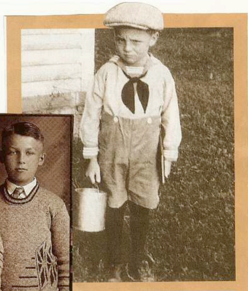
Note the lunchpail!

There were dress up knicker suits or a knicker with a jacket (note the hi-top tennis shoes). Knickers were worn everywhere with everything - jackets, helmets, black stockings, sweaters, shirts . . . knickers, knickers, and more knickers!