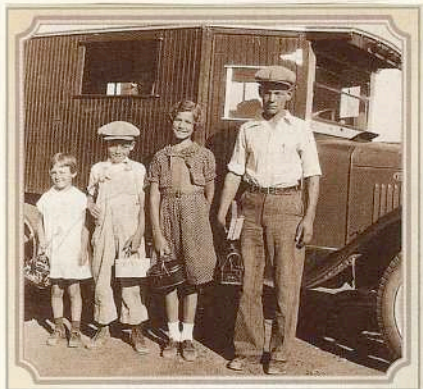
Note the lunchboxes

Girl's dresses with boleros and sweaters. Shift styled dresses were similar to their mother's house frocks.