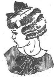
"Miss Junior" Wave

"Crowning glory" into short "Bob's" (hair worn short and close to the head). First seen as straight with bangs, it evolved to softer waved styles. They were achieved with a heated "Marcel iron", pin curls