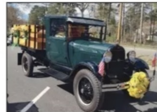
Gloucester Daffodil Parade.

Colonial Virginia: The touring season is upon us. April was especially busy with the Gloucester Daffodil Parade, a tour to Endview Plantation in Newport News, and meeting with the Old Dominion Club for Ashland Train Day. Some of our members traveled to South