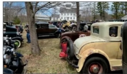
A beautiful late April day for the dust-off tour.