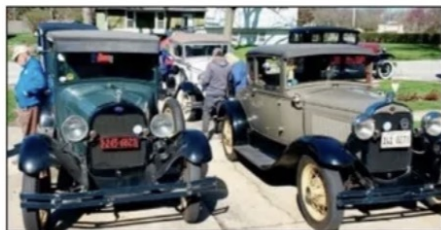
One stop on our garage tour.