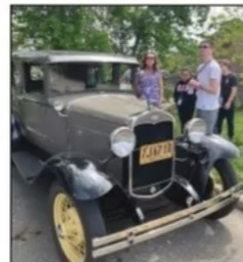
At Bay Shore High School.