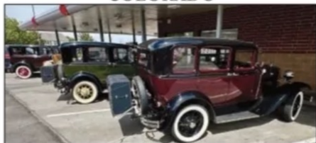
The year's first Sonic Sunday.

Model A Ford Club of Colorado: Monthly summer Sonic Sundays began with eight Model A's and 27 people. We've planned many tours, meals, meetings, and fun! Coming up: Park Hill parade July 4; Canon City/Royal Gorge bridge tour July 15-16; cars, coffee, donuts in Thornton July 20; Bird City tour July 26-28; Hometown Days parade August 10; pancake breakfast August 17; ladies drive an A tour August 31 (It's time I learn!) Sherri Krueger