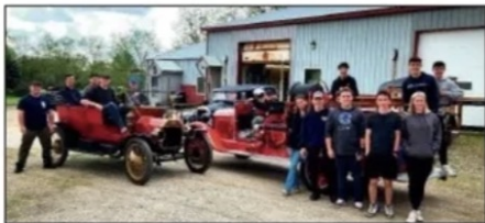
Model A youth event in May at the 40 Horse Farm.