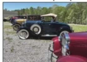
On our fish fry tour.