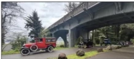
Parking lot poker under the McCullough Bridge.